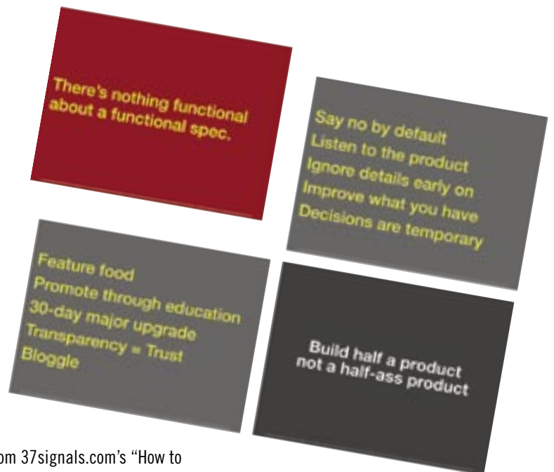
Slides from 37signals.com's "How to make big things happen with small teams," presented at South by Southwest Interactive, Austin, TX in 2005.

Projects entering should foster the sustainable mind set of design. The contest welcomes all creative entries that combine high-quality design with a distinct contribution to the goal of sustainable need-fulfilment. Priority value is assigned to environmental, economical and social benefits throughout the life cycle of the proposed design.