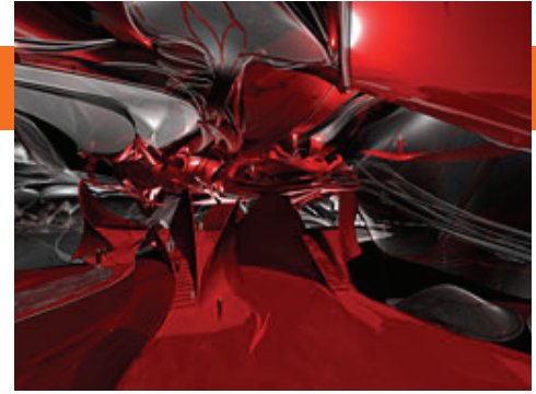
Hernán Díaz Alonso Busan Concert Hall, Busan, South Korea, 2003–2004 Digital drawing

Edge Conditions features the work of over a dozen artists whose digital art is among the most exciting and challenging contemporary art being created today. An "edge condition" can be considered a situation that occurs only at an extreme operating parameter. Edge conditions are the boundaries between art and technology, between human and machine, between concept and instantiation, between what is known and the experimental. Most importantly, edge conditions define new possibilities or, like edge cities, reveal conditions that have already emerged.