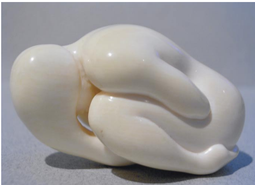
Roy Rankin Crouching Nude , 1989 from Contemporary Netsuke: Masterful Miniatures

GRAVITY FREE is a multidisciplinary design innovation conference that explores a provocative landscape of essential questions familiar to every practicing designer. Self-described as