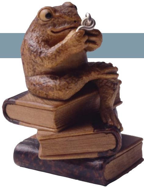
Kiho Takagi Puzzled Frog, 1997 from Contemporary Netsuke: Masterful Miniatures